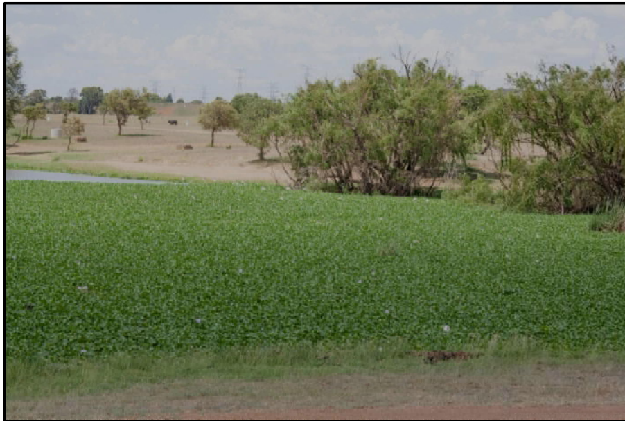
Fig 2 - The extent of the invasive water hyacinth along the shores of Rooidam outside Bloemfontein where the African Jacanas have been observed since October 2014.

The first observation of the species at Rooidam in a SABAP2 survey was on 3 October 2014. At the end of the dry winter season water levels had dropped considerably and a mat of water hyacinth covered the bays and extended areas of the dam. I observed a single African Jacana foraging on the mat of water hyacinth in one of the covered bays (Fig 1). It was observed alongside Squacco Heron, Little Egret, Cattle Egret and Black-crowned Night Heron. Later in the morning on my return along the same route the bird could not be located.