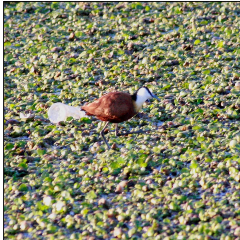
Fig 1 - African Jacana foraging on mat of water hyacinth in one of the bays at Rooidam, outside Bloemfontein on 3 October 2014 – not the presence of plastic pollutants.

The following observations of African Jacanas during regular SABAP2 surveys in pentad 2910_2610 outside Bloemfontein are of interest. The pentad includes the wetland areas of Rooidam near the Ferreira Road and the eastern section of Leeuberg (highest point 1605 m asl) which borders the N1 highway in both the northern and southern directions. Rooidam is a manmade dam which is bordered by the suburban areas of Louierpark and the Ferreira Road