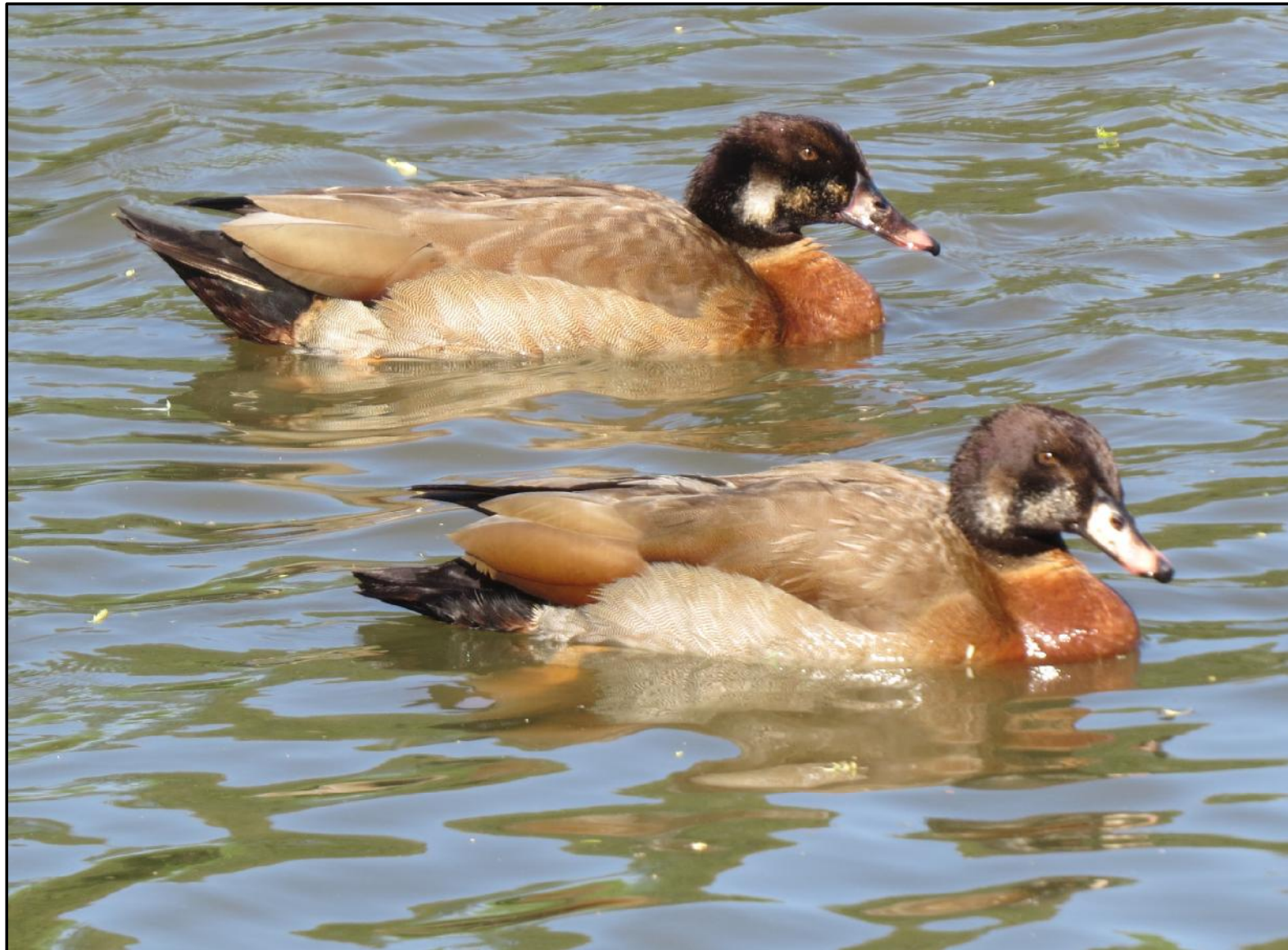
Fig 1 – The birds which presumably are Mallard x Egyptian Goose hybrids photographed at Gillooly's Farm in September 2014.