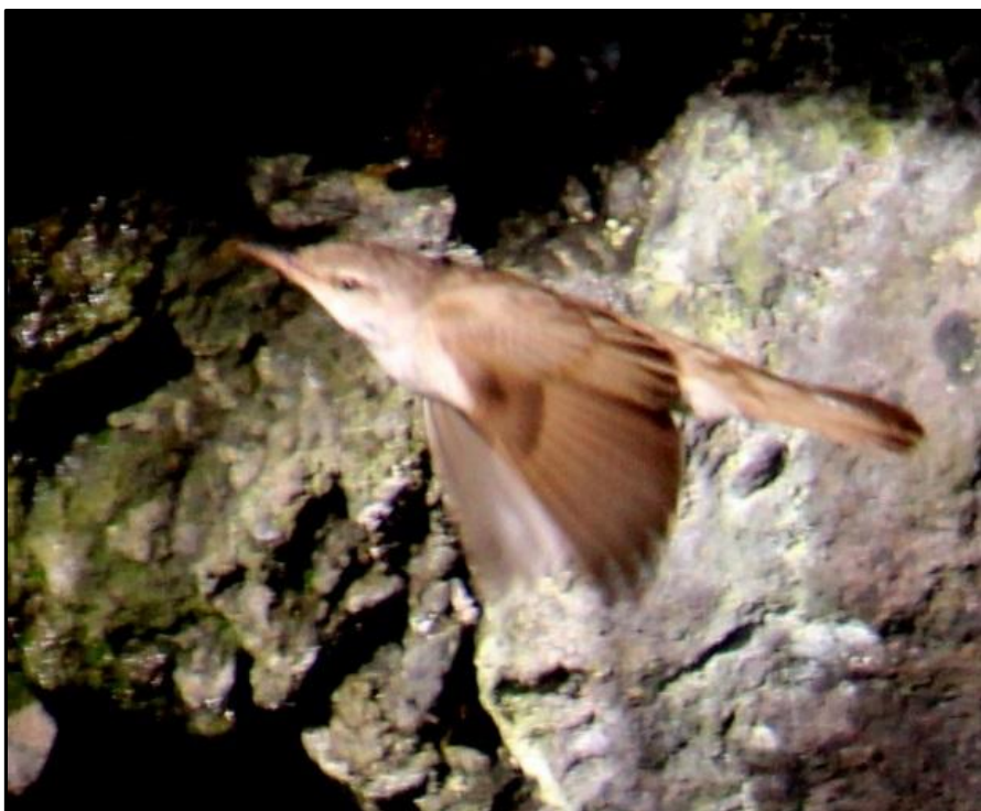
Fig 2 – The Great Reed Warbler which was observed on the north-eastern shore of Marion Island – in flight.

reported at the Prince Edward Islands (Gartshore 1987; Oosthuizen et al. 2009; unpublished data). The only other warbler species to have been recorded on islands in the southern Indian Ocean, is the Willow Warbler Phylloscopus trochilus , which has been reported at both Marion (Gartshore 1987; Oosthuizen et al. 2009) and Kerguelen Islands (Ausilio and Zotier 1989).