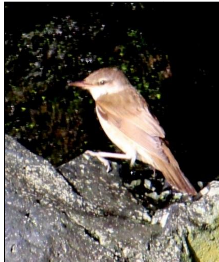
Fig 1 – The Great Reed Warbler that was sighted on the north-eastern shore of Marion Island perching.

Between 6 and 13 June 2014, a Great Reed Warbler was observed and photographed on the north-eastern shore of Marion Island at Rockhopper Bay (S46°52.619' E37°51.568'). This is not only the first record of this species for the Prince Edward Islands, but also the southern-most record for this species. The bird was extremely