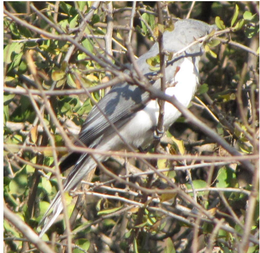
Fig 1 - White-breasted Cuckooshrike Coracina pectoralis (male)