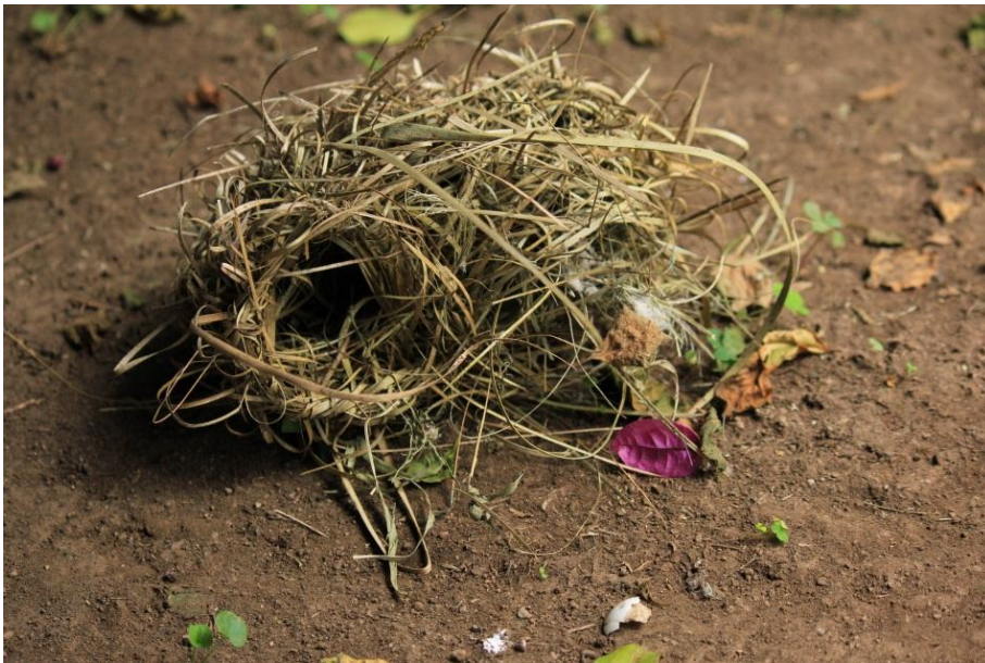
Fig. 2 - The first nest that was dropped (broken egg shell next to it).