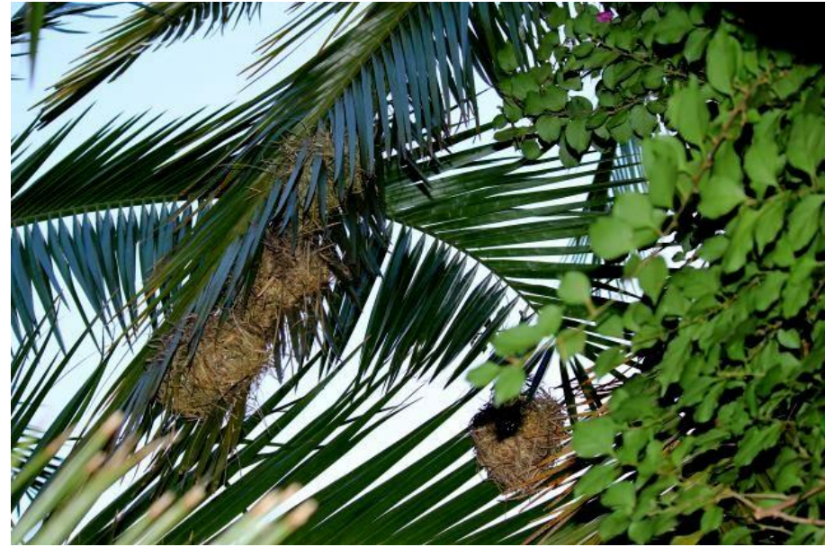
Fig 1 - Baglafaecht Weaver nests – part of the colony on 21 June 2013.

On 25 June 2013 a young male of the local Vervet Monkey Cerco-pithecus pygerythrus troop raided the Baglafaecht Weaver nest site (see PHOWN 5892). Although there were other monkeys, he was the only one that took nests. There were two males and one female Baglafaecht Weavers in the tree next to the nest site making quite a noise. The monkey first took an old nest which was left on the ground (I presume he did not find anything inside; Fig. 2) and then took a new green nest. He jumped out of the tree and went to another tree where he sat and started ripping the nest apart (Fig. 3). I discovered one egg under the nest site and it looked like he took out another egg while he was sitting in the other tree.