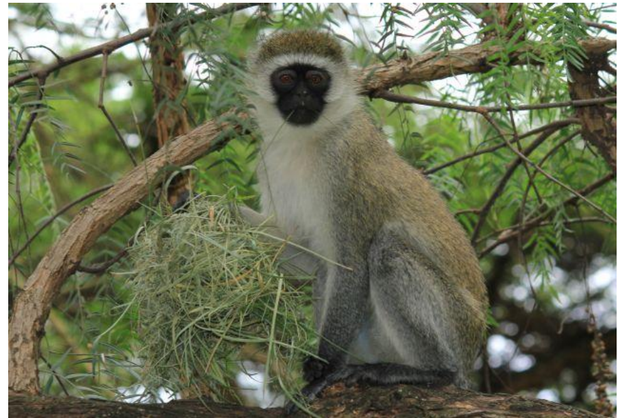
Fig. 3 - Vervet Monkey with Baglafaecht Weaver nest.