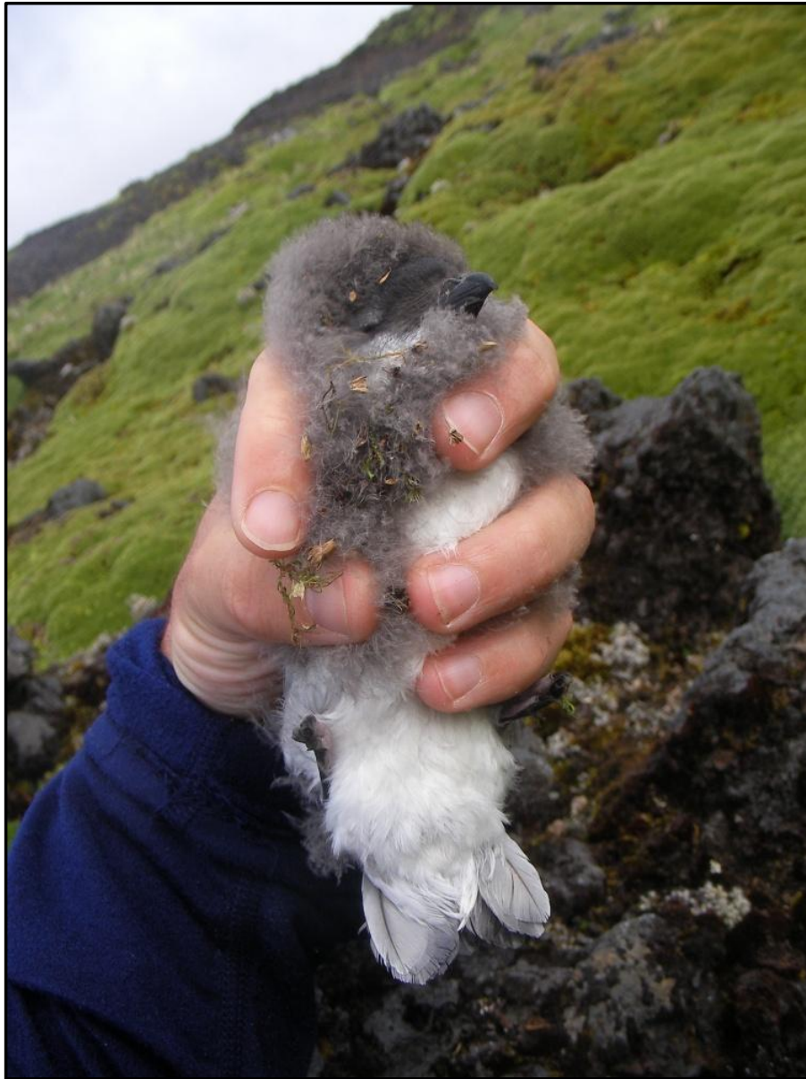
Fig 1- Diving petrel chick on Marion Island, 10 March 2011.

partially downy chick weighing 70 g. Although photographed (Fig .1), the chick was not definitively identified to species, although the altitude and substratum suggests it was a South Georgia Diving Petrel.