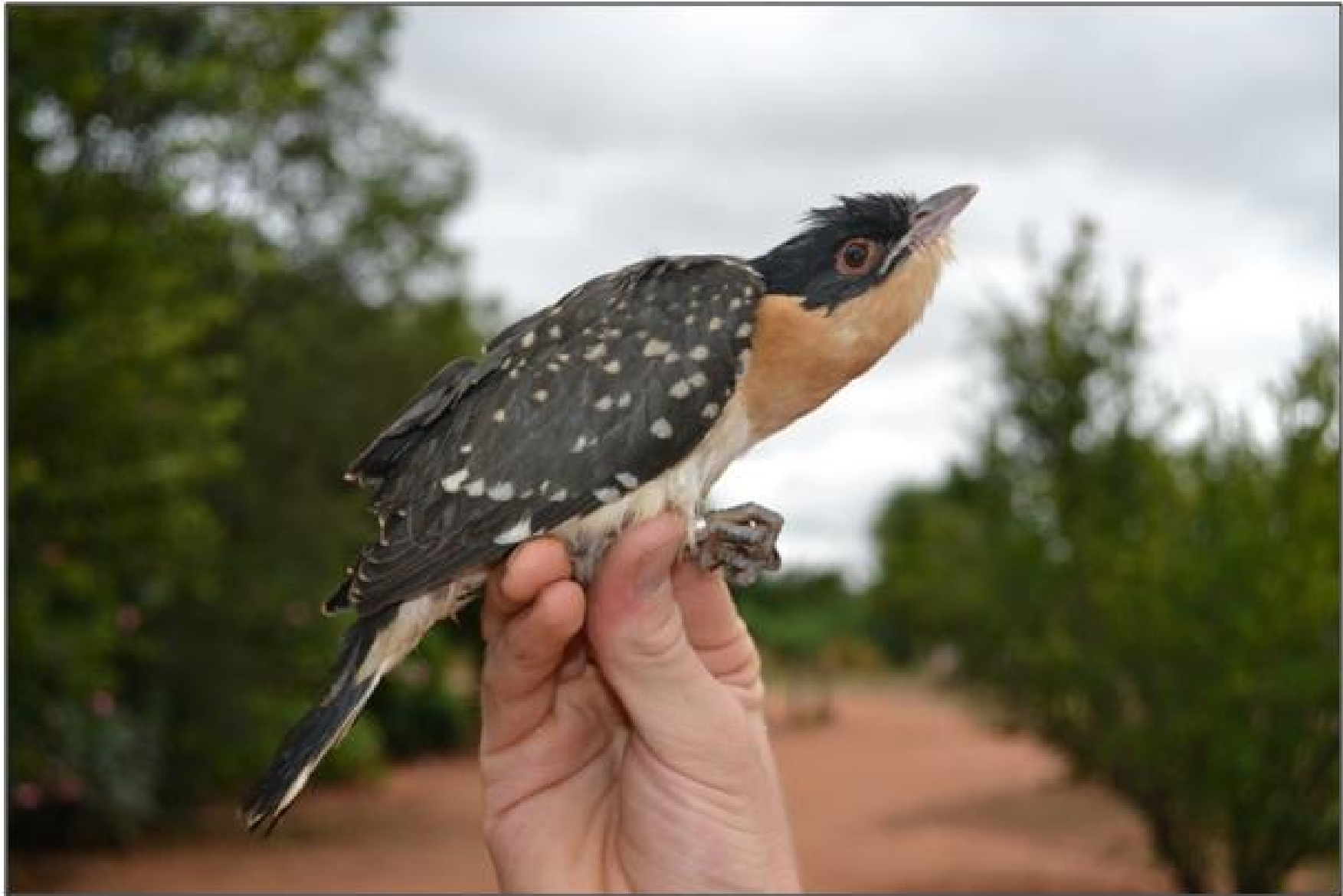
Fig 4 - The ringed Great Spotted Cuckoo on 20 January 2013