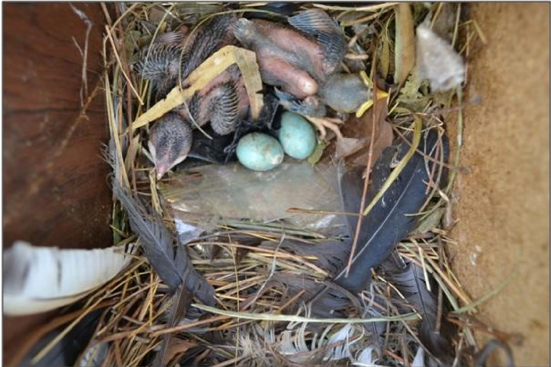
Fig 2 – Great Spotted Cuckoo chick on the left and Myna chick on the right