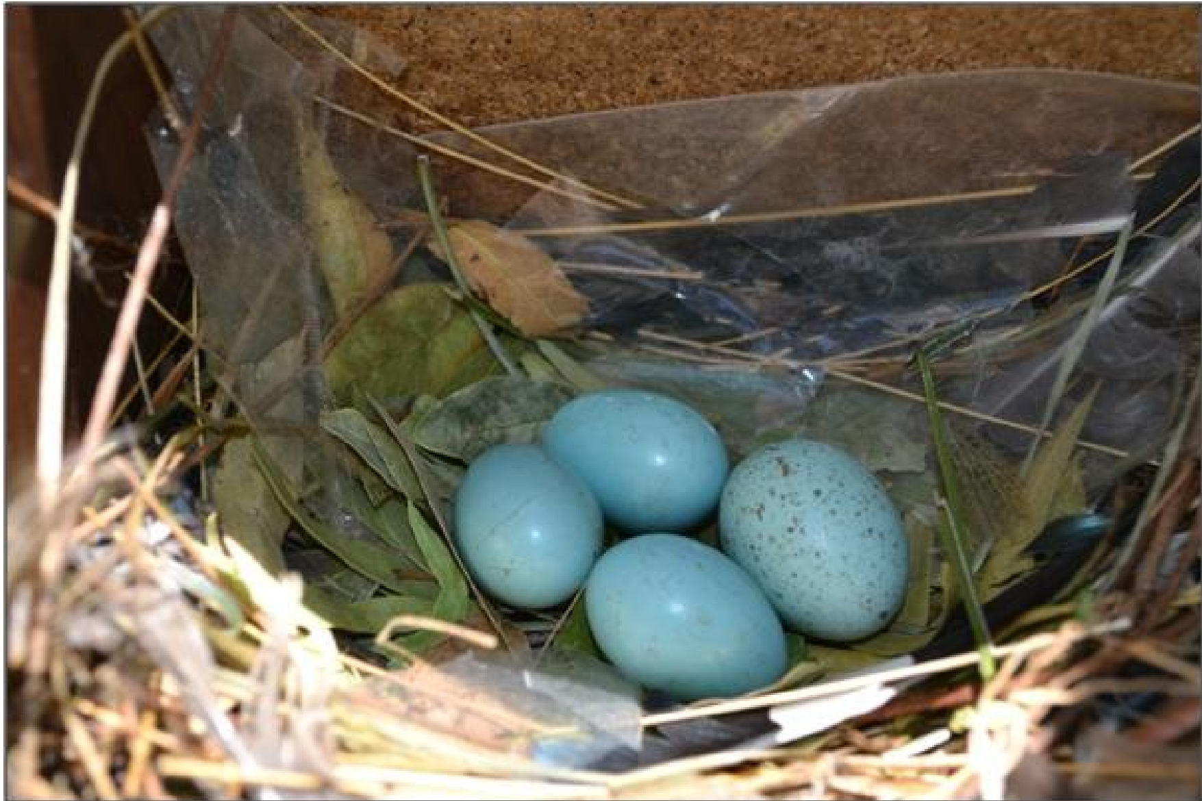
Fig 1 - The 3 Myna eggs clearly smaller than the speckled Great Spotted Cuckoo egg.