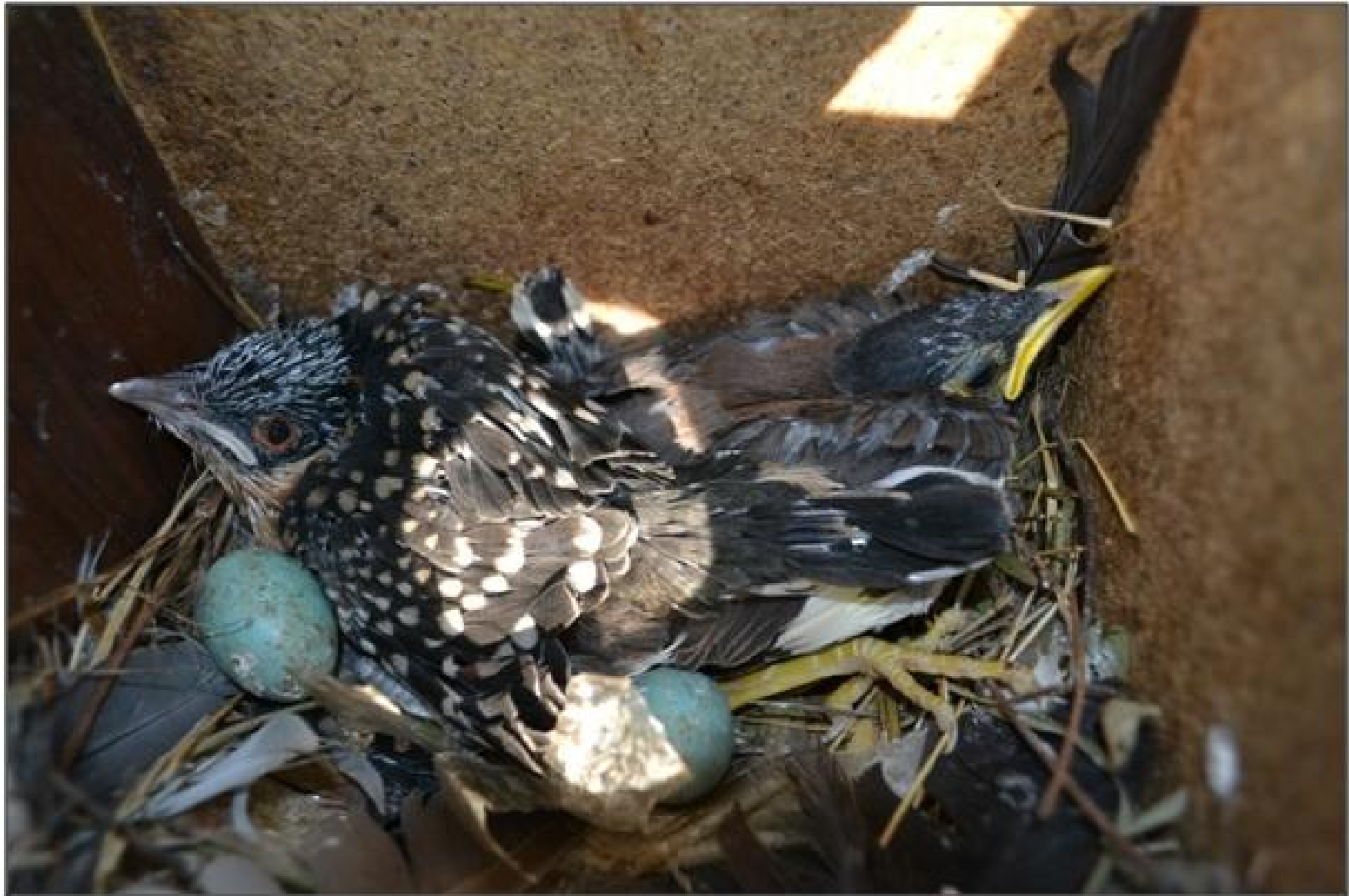
Fig 3 – Great Spotted Cuckoo (left) much larger than Myna (right)