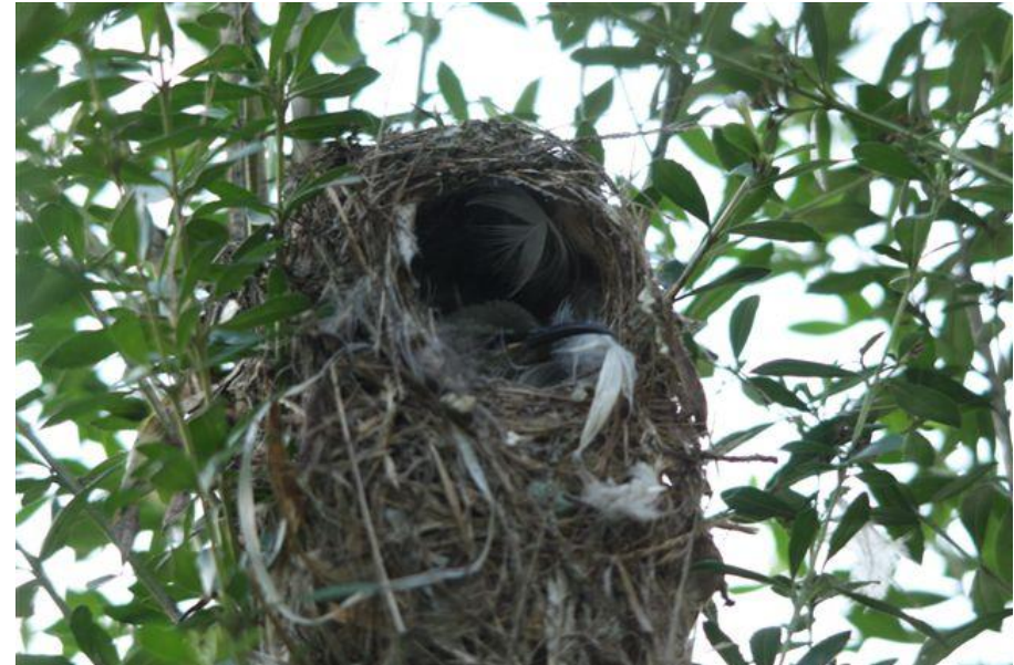
Figure 1 – The juvenile Greater Double-collared Sunbird peeping from the nest.

From 8 October, after the weather had cleared up, it was back in the Bottle Brush tree and it returned to the nest at nightfall. One afternoon around 17:00 I observed the female going into the nest.