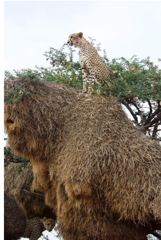
Figure 1. Two male cheetahs on Sociable Weaver colony 42 at Tswalu Nature Reserve (PHOWN 25499).

Cheetahs are observed frequently and life histories of certain individuals are fully recorded. This includes the life histories of the Cheetahs observed using Sociable Weaver colonies.