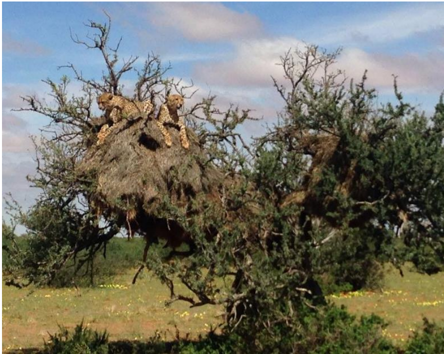
Figure 2. Sociable Weaver colony 79 with two male cheetahs resting on top (PHOWN 25500).

Tswalu Kalahari is a large private reserve in the Northern Cape province, South Africa (27°13'30"S and 22°28'40"E), situated between the towns of Hotazel and Van Zylsrus. At Tswalu Kalahari over 250 Sociable Weaver colonies have been mapped in a study area that covers less than 10% of the reserve area (Robert Thomson unpublished data, see PHOWN ( http://weavers.adu.org.za/phown.php )). The observations described all occur within this study area.