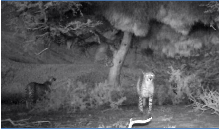
Figure 4. Three cheetahs at Sociable Weaver colony 76, two are on the ground while one is climbing the tree (PHOWN 25502).

During the morning of the 22 April 2016, LDC observed the same two adult males on top of colony 79 (Fig. 2). Here they stayed for approximately 45 minutes using it as a vantage point. They appeared to be actively looking for prey. Once they climbed down they walked for a short while before lying down to rest.