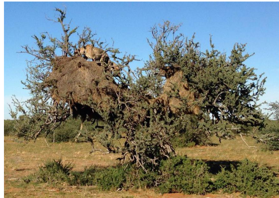
Figure 5. Male cheetahs return to colony 79 (PHOWN 25503)

On the 3 May 2016 at 18:26 three cheetahs were captured on a camera trap at colony 76. These are believed to be the three adolescent cubs that were observed at colony 81 on the 21 April. However, the mother was not captured on the camera. One of these can be seen climbing the tree (Fig. 4).