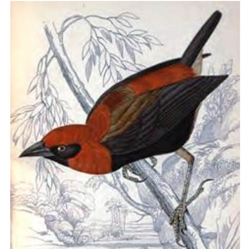
Fig. 1. Black-winged Bishop, figure from Swainson (1837).

Currently, 117 living species of weavers in the Ploceidae family are recognised. Hoyo et al. (2010) listed 116 species but Safford & Hawkins (2013) split the Aldabra Fody Foudia aldabrana from the Red-headed Fody Foudia eminentissima . Dickinson & Christidis (2014) also listed 117 species.