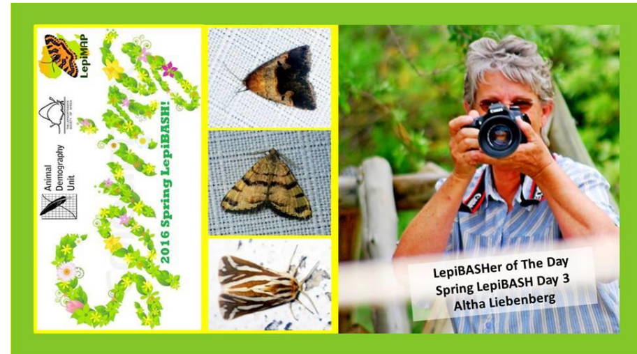
Figure 2. Altha Liebenburg, Danielskuil, Northern Cape, was LepiBASHer of the Day 3 of the October 2016 LepiBASH; she has also submitted the most records on Day 1 (Table 2)