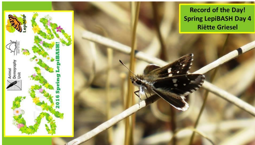
Figure 6. Record of the Day for Day 4 of the October 2016 LepiBASH (see Table 2)