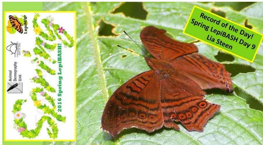
Figure 7. Record of the Day for Day 8 of the October 2016 LepiBASH (see Table 2)