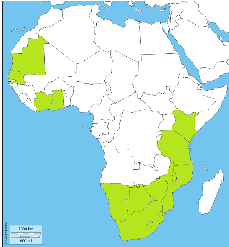
Figure 3. Countries for which LepiMAP records were submitted during the October 2016 LepiBASH. Southern Africa: Botswana, Malawi, Mozambique, Namibia, South Africa, Swaziland and Zimbabwe. Eastern Africa: Kenya and Tanzania. Western Africa: Côte d'Ivoire, Ghana, Mauritania and Senegal.