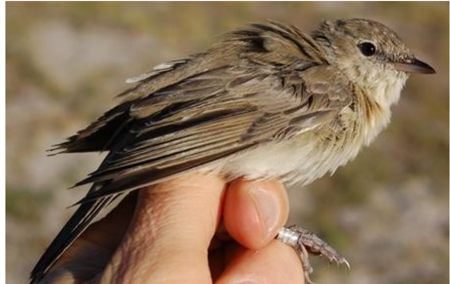
Fig. 1. Garden Warbler, ring FB47375, caught at Princess Vlei, Cape Town, on 6 February 2016. There are more photos at http://vmus.adu.org.za/?vm=BirdPix-24086

Bushes and trees, between the reeds around the vlei near the ringing site, provide possible foraging habitat for the Garden Warbler. It was not noted here during our previous session on 2 January 2016.