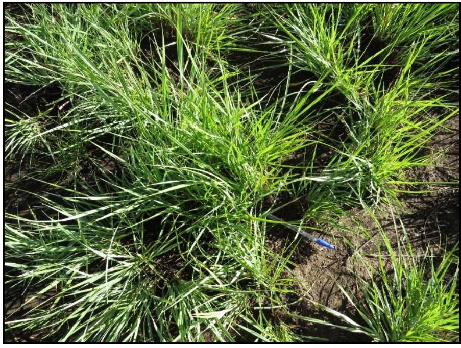
Fig 3 – The nest lies hidden in the tuft at the end of the pen.

provisioning birds we estimate that there were at least three active nests in a relatively small area (c. 4000 m²). We were able to find only one nest, with three fully feathered chicks (Fig 2, cf. Figure 8 of Davies and Christian, 2006.). The nest was built into a grass tuft of the predominant grass species, and was well concealed from above (Fig 3). We returned to check on the nest on 21 December 2012 and found it to be empty; given their advanced development when found, it seems likely that the chicks had fledged.