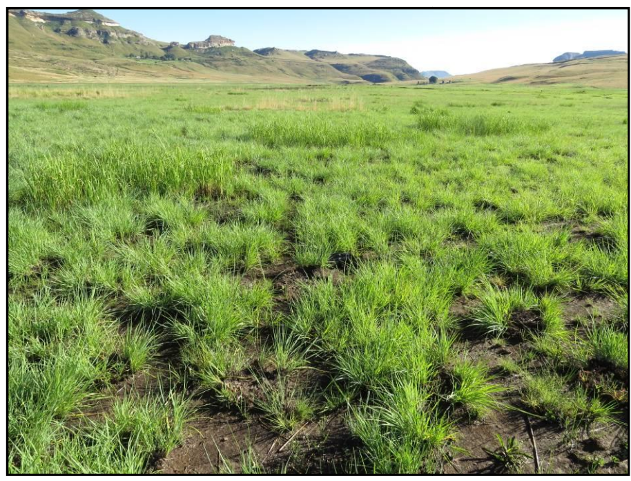
Fig 1 – Ankle-height, regenerating grassland on the floodplain of the Klerk River; breeding habitat for Short-tailed Pipit.

The second site, in Golden Gate Highlands National Park, is centred on the floodplain of the Klerk River, below the prominent sandstone escarpment of the area, in pentad 2830_2840. The birds were