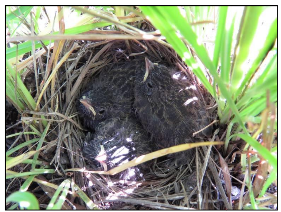
Fig 2 – Three fully feathered Short-tailed Pipit nestlings photographed on 18 December 2012.

provisioning birds we estimate that there were at least three active nests in a relatively small area (c. 4000 m²). We were able to find only one nest, with three fully feathered chicks (Fig 2, cf. Figure 8 of Davies and Christian, 2006.). The nest was built into a grass tuft of the predominant grass species, and was well concealed from above (Fig 3). We returned to check on the nest on 21 December 2012 and found it to be empty; given their advanced development when found, it seems likely that the chicks had fledged.