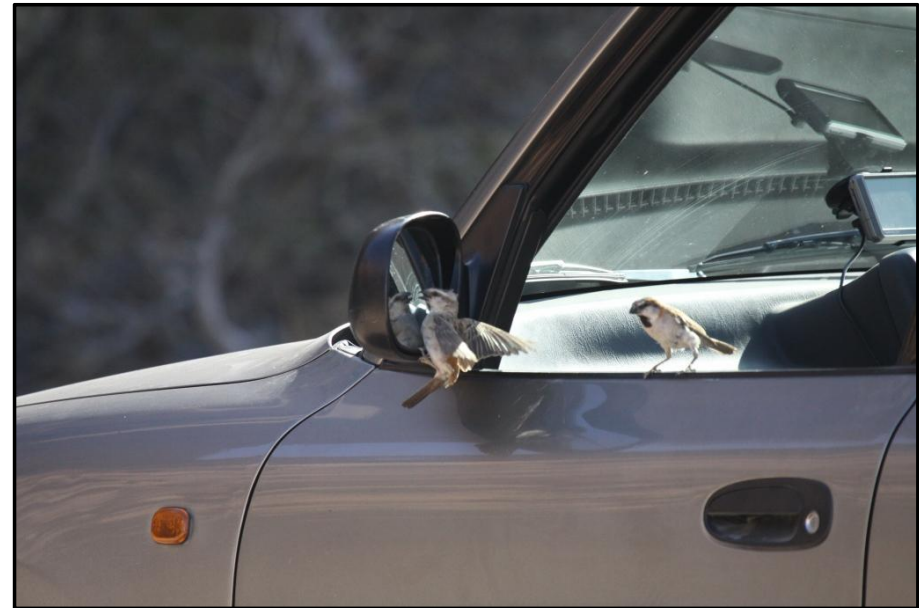
Fig 3 – While the male watches, a female Great Sparrow Passer motitensis attacks a car mirror in Spitzkoppe, Namibia.

Observers of shadow boxing sometimes worry about the damage the behaviour causes, like in the case of the window breaking Magpie-lark (Ford 1903). Larger, stronger species do more damage. "Obsessive" shadow boxing of the Australian kingfisher-like Laughing Kookaburra Dacelo novaeguineae is reported to frequently cause broken windows (Temby 2004) and in Africa Southern Ground-Hornbills Bucorvus leadbeateri notoriously destroy windows (Mabula Ground Hornbill Conservation Project 2012) and even vehicles if the bodywork is very reflective (Greve 2008). The constant ticking of shadow boxing birds and dirty marks on the glass annoys some people (e.g. Temby 2004). Shadow boxing can only be prevented by removing the reflection (The Royal Society for the Protection of Birds 2012, The Cornell Lab of Ornithology 2012). One of the ways to do this is to put transparent cling foil against the outside of a window (Vogelbescherming 2011).