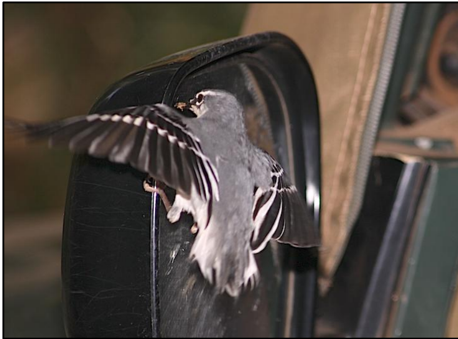
Fig 4 – A Mountain Wagtail Motacilla clara shadow boxing near Malelane, South Africa.

The pair was only observed at one particular window, presumably because this is the only window where the birds can sit or hop in a bush and see their own reflection, but birds are also known to "habitually attack only a particular window" (The Royal Society for the Protection of Birds 2012). The only other bird species that was occasionally recorded at this window showing a mild interest in its reflection was a male Spectacled Weaver Ploceus ocularis . The sunbirds would not fly inside if the window was open, which is consistent with existing literature (e.g. Koumly 1893). The birds were also not distracted if a person stood close to the window inside the house, consistent with many accounts including birds being