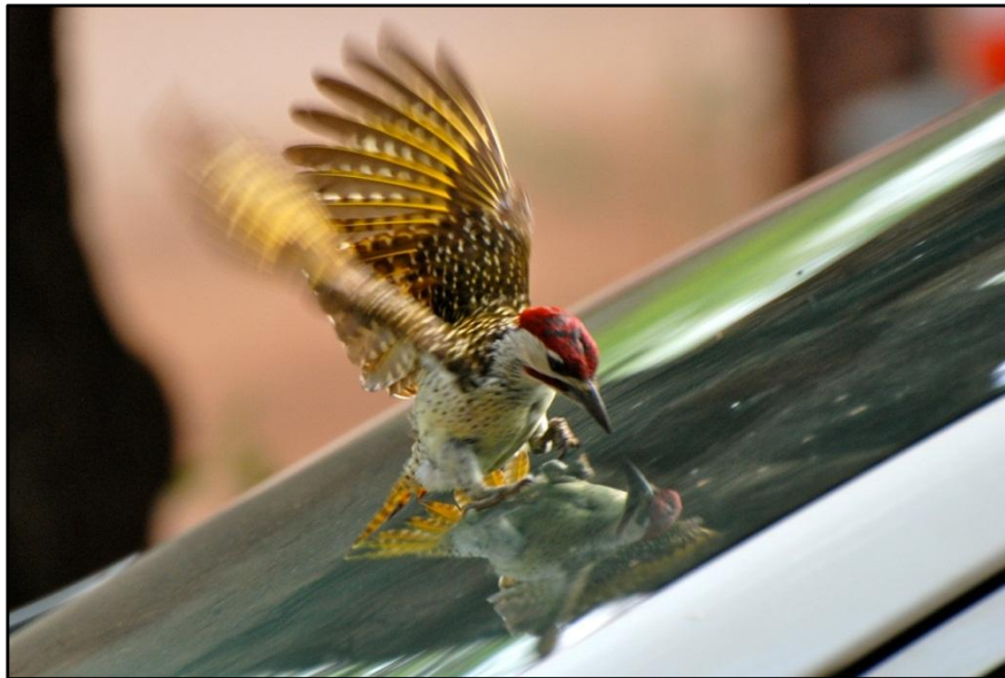
Fig 1 – A male Bennett's Woodpecker Campethera bennettii attacks the windscreen of a vehicle in Satara, Kruger National Park, South Africa.

latter term was also used by the Southern African ornithologist Jack Skead and is adopted in this study.