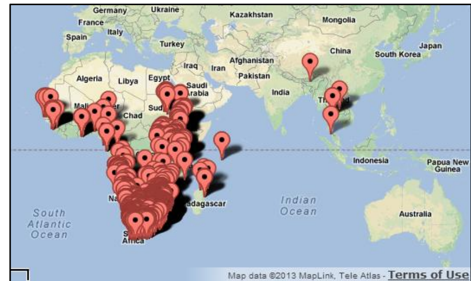
Fig 1 – Distribution of weaver breeding records, PHOWN 2010-2012

There are PHOWN records from 28 countries (Fig. 1); the top 10 are listed in Table 3. The natural range of weavers covers about 60 countries, in sub-Saharan Africa, southern Asia and the Indian Ocean islands. Most PHOWN records were from South Africa and Namibia. Species richness map for South Africa from the Virtual Museum web shows hot spots from Mpumulanga, Gauteng, KwaZulu-Natal coast and Cape Town (Fig. 2).