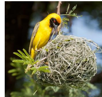
Southern Masked Weaver male at nest (from PHOWN record 1788).