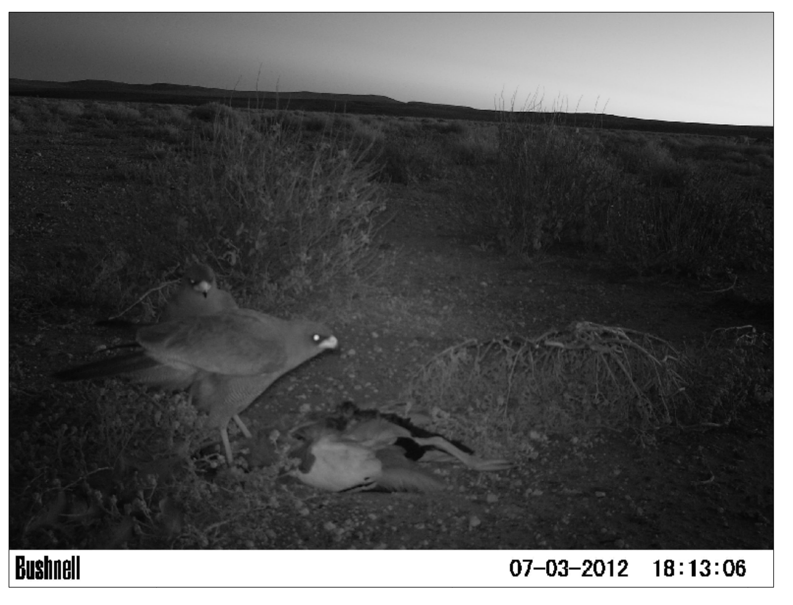
Fig 1. An image of the Southern Pale Chanting Goshawks feeding on the carcass at dusk on 3 July 2012 (taken with infra-red flash).