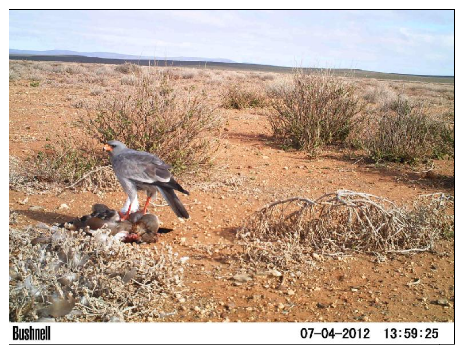
Fig 2. The Southern Pale Chanting Goshawk feeding on the carcass during the day on 4 July 2012.