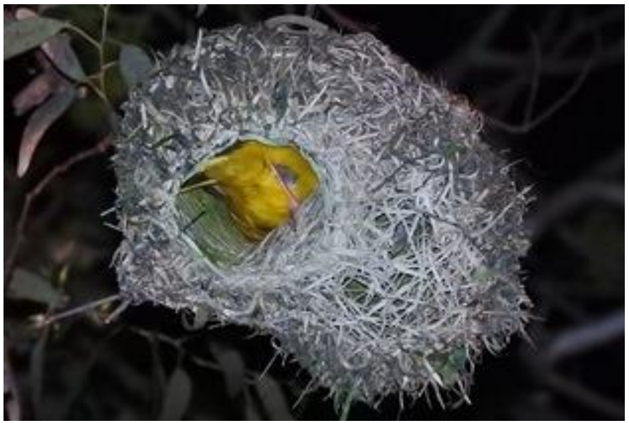
Figure 5. Cape Weaver, adult male, tail at entrance (PHOWN 23399).

In Pinelands all birds except one were seen with their heads facing the nest entrance – one weaver had the tail facing the entrance (Fig. 5). The heads were tucked back when asleep (Fig. 3,6,7) or visible when awake (Fig. 2).