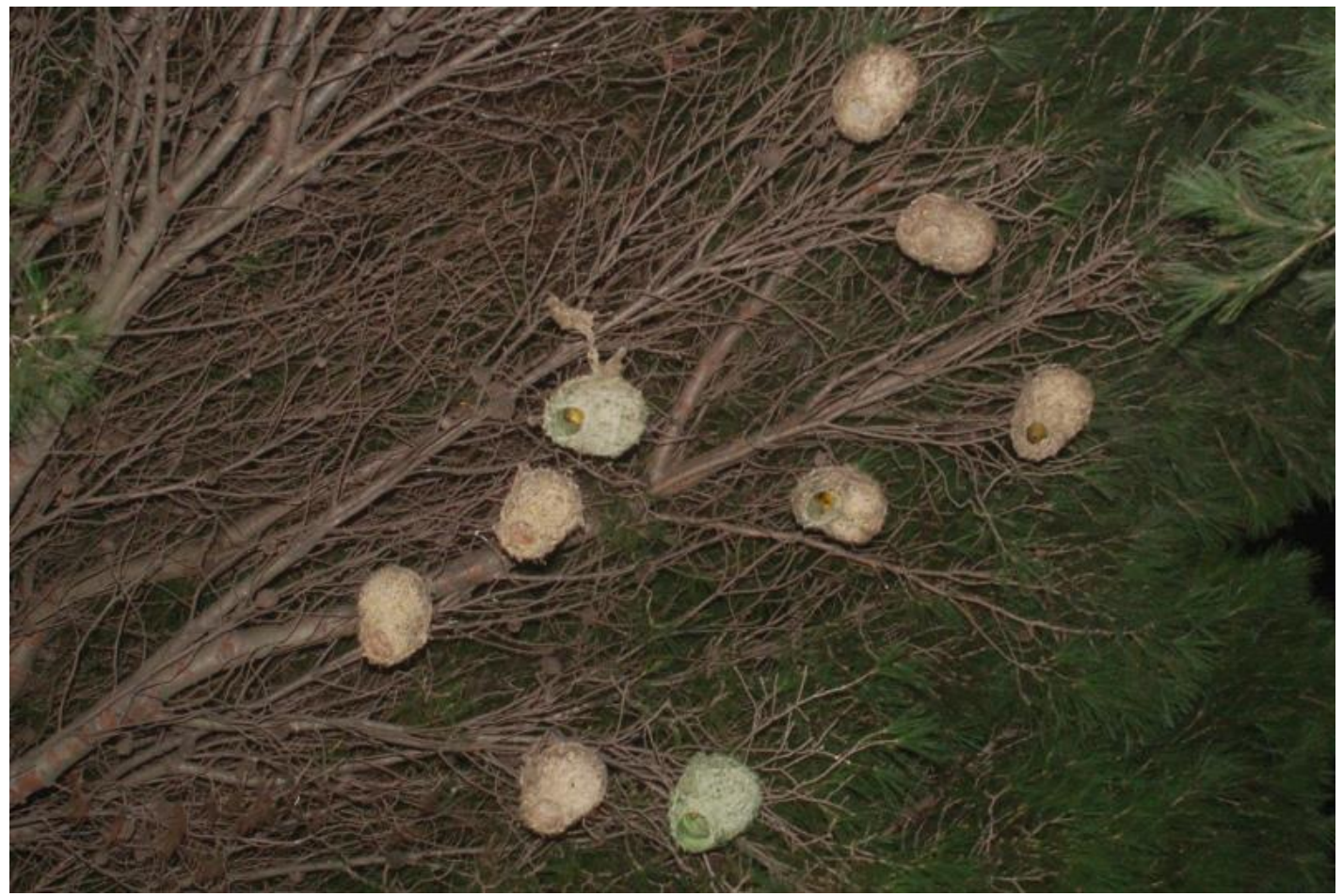
Figure 8. Colony Rust-en-Vrede Mid, Pinelands, showing several roosting Cape Weavers (PHOWN 21989).

White FN, Bartholomew GA, Howell T 1975. The thermal significance of the nest of the Sociable Weaver Philetairus socius : winter observations. Ibis 117:171-179.