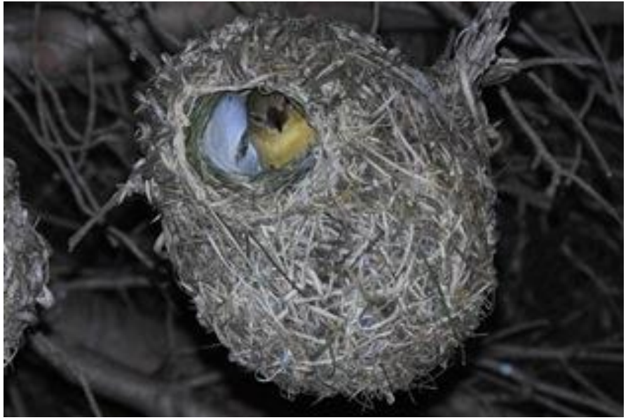
Figure 2. Cape Weaver, adult female in an old breeding nest, awake (PHOWN 23402).

Birds could choose to roost in old breeding or non-breeding nests. Old breeding nests have nest lining added and could thus provide more insulation, but could also possibly harbour more parasites.