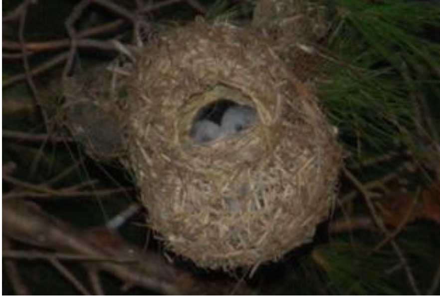
Figure 7. Cape Sparrow, adult male, head tucked in (PHOWN 19005).

The Southern Masked Weaver nests that could be observed in Rondebosch did not have any Cape Sparrows roosting in them. Cape Sparrows prefer Cape Weaver nests for breeding, and this may influence roosting choices (Oschadleus & McCarthy 2015), although it should be expected that Cape Sparrows may roost in the nests of other weavers occasionally.