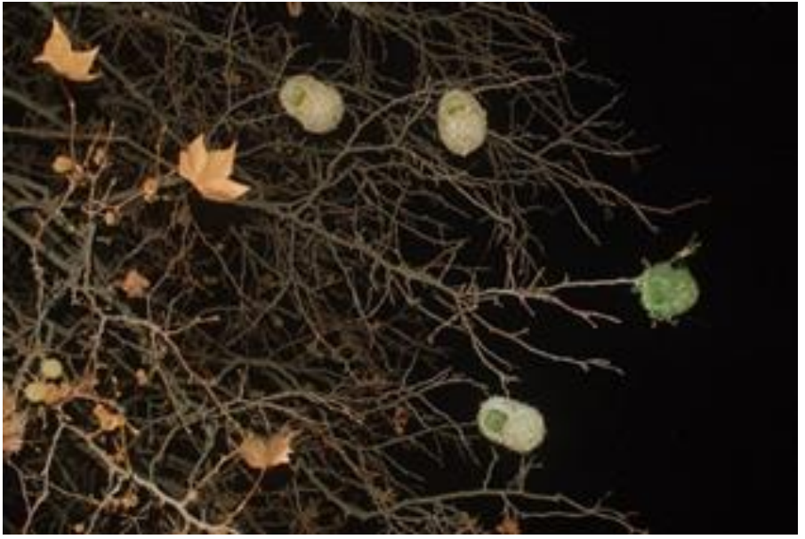
Figure 1. Colony Crescent G-Plane, Pinelands (PHOWN 21987).

Weaver nests are known to provide suitable breeding and roosting sites for a variety of birds (del Hoyo et al. 2010). This could be to reduce the energetic costs of nest building (Mainwaring & Hartley 2013). Weaver nests could also provide thermal benefits (McKechnie & Lovegrove 2003). Thus, we thus hypothesised that the number of birds roosting in weaver colonies may increase as the weather becomes colder.