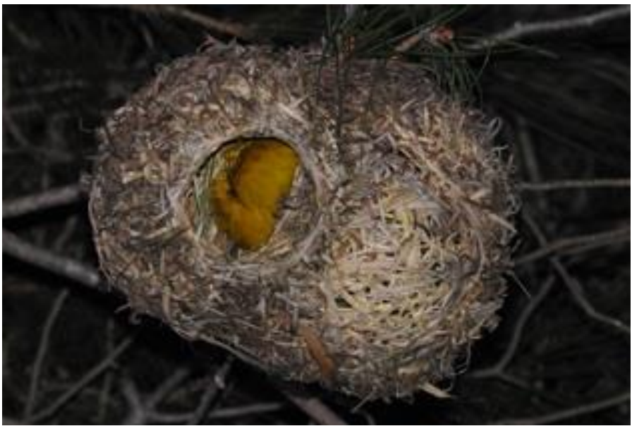
Figure 3. Cape Weaver, adult male, head tucked in (PHOWN 20165).

We monitored seven Cape Weaver colonies in Pinelands, Cape Town, on six visits at 3-4 weeks intervals in late summer, through winter, and to the start of breeding (13 March – 31 Aug 2016). The colonies were visited at night between 20h00 and 21h30. The total number of nests in each colony or sub-colony was recorded (Fig. 1). A torch was shone onto each nest and photos taken of nests where birds were seen in the nest (Fig. 2,3,5 6 & 7). Several Pinelands colonies were similar to those in Oschadleus & Werner (2015).