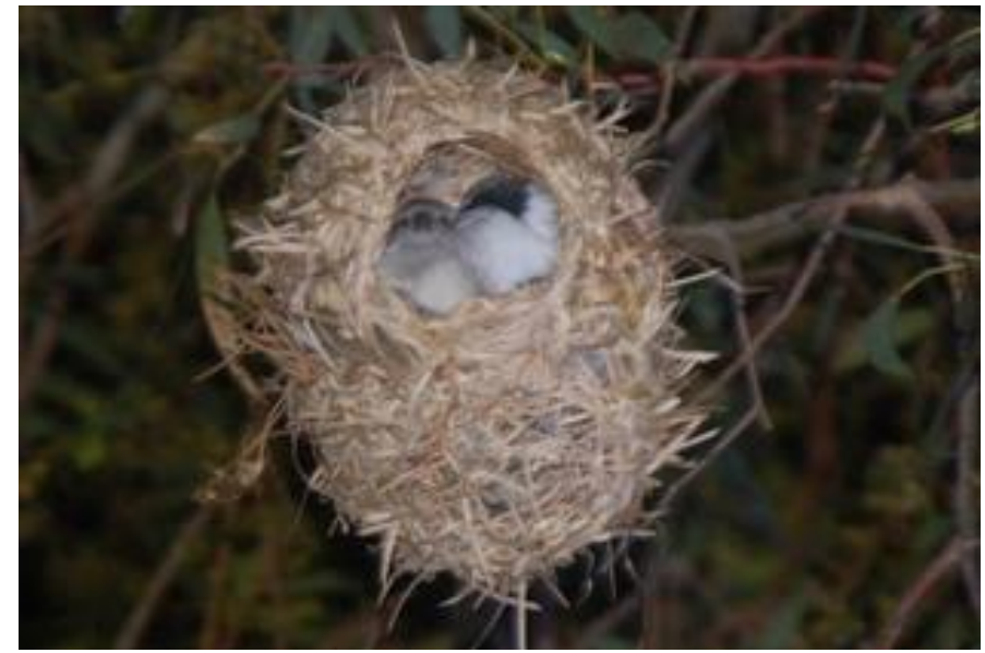
Figure 6. Cape Sparrow pair in Cape Weaver nest (PHOWN 19002).

This study does not support the thermal benefits of birds roosting in weaver nests, at least not in semi-urban Cape Town. The increase in numbers of Cape Weavers most likely reflects birds returning to their colonies in preparation for the breeding season. The decrease in Cape Sparrows roosting in weaver nests over time could be due to displacement by the increasing number of Cape Weavers, and/or due to the sparrows starting to prepare for breeding in their own nests.