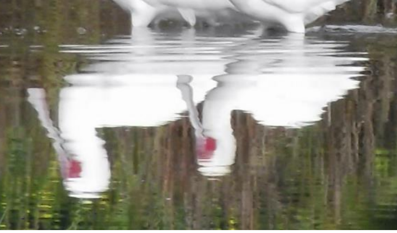
Figure 1. African Spoonbills, Intaka Island, Century City, Cape Town. BirdPix section of the ADU Virtual Museum. Photographer © Fanie Rautenbach. (See http://vmus.adu.org.za/?vm=BirdPix-262)

This paper deals with the African Spoonbill Platalea alba (Figure 1). The threat status of this species is given as "Least Concern" (Taylor et al. 2015).