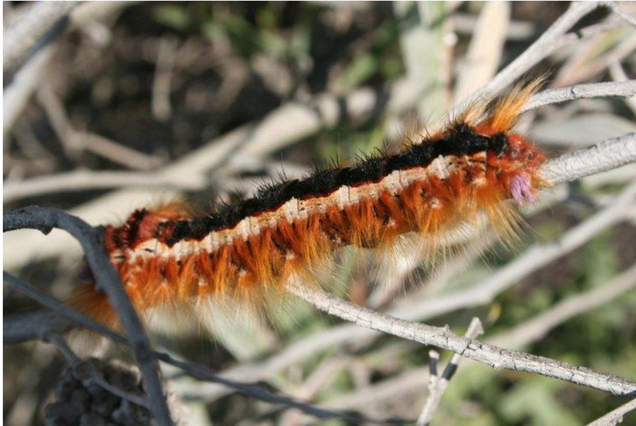
Figure 7. Caterpillar of Cape Lappet