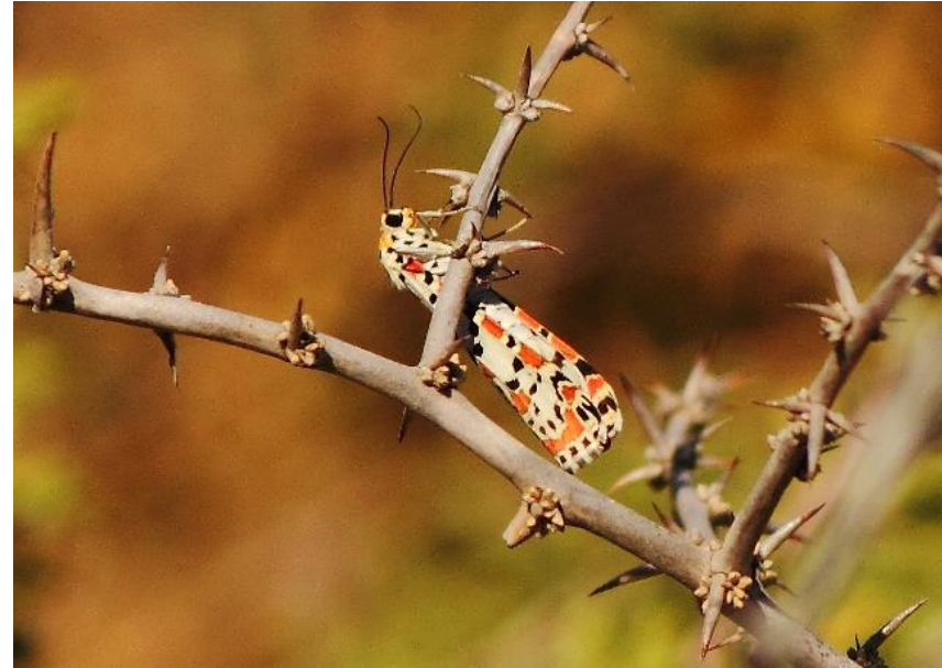
Figure 8. Crimson-speckled Footman

The Cape Lappet Moth (Family Lasiocampidae) (Figure 7) is primarily found in South Africa, but some sources also list Tanzania, Malawi, and Mozambique (Picker et al. 2004). During the larval stage, Cape Lappets feed on a wide variety of plants and are often found in large aggregations. The adults are large and stocky, with an average wingspan of about 70 mm. Both hind wings and fore wings are reddish brown in colour (Picker et al. 2004).