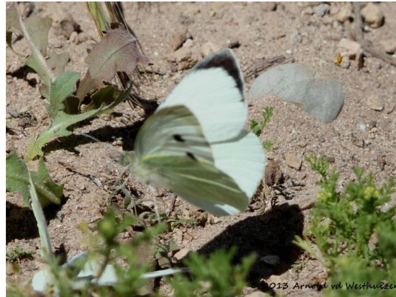
Figure 4. Cabbage White

The Brown-veined White (Family Pieridae) (Figure 3) is a small to medium-sized butterfly (Woodhall 2005). It is found throughout South Asia and Africa. In South Africa, it is a common sight during summer and autumn when large numbers migrate north-east over the interior of the country.