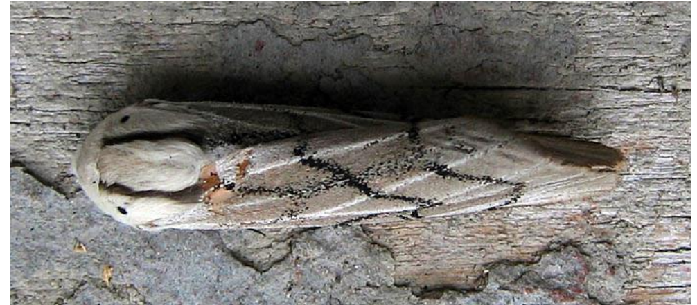
Figure 12. Tricoloured Tiger

The Cape Lawn Moth (Family Noctuidae) (Figure 11) occurs across most of Africa. The Cape Lawn Moth lays its eggs in bunches on grass, where they hatch into small green larvae. Initially, they feed in the thatch of the grass at ground level. This species is also known as the Grasslawn Armyworm, and is sometimes regarded as a pest (Picker et al. 2004).