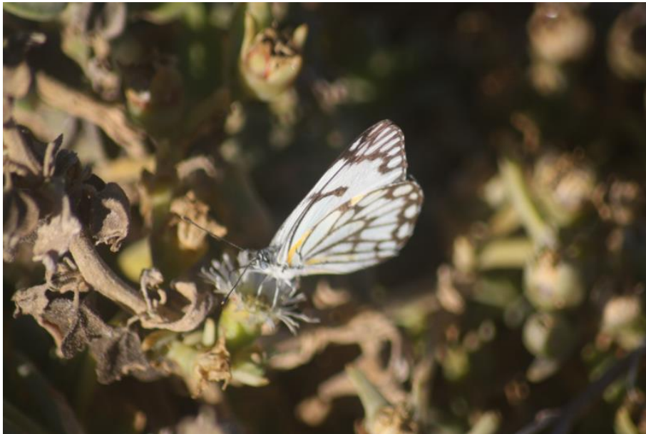
Figure 3. Brown-veined White