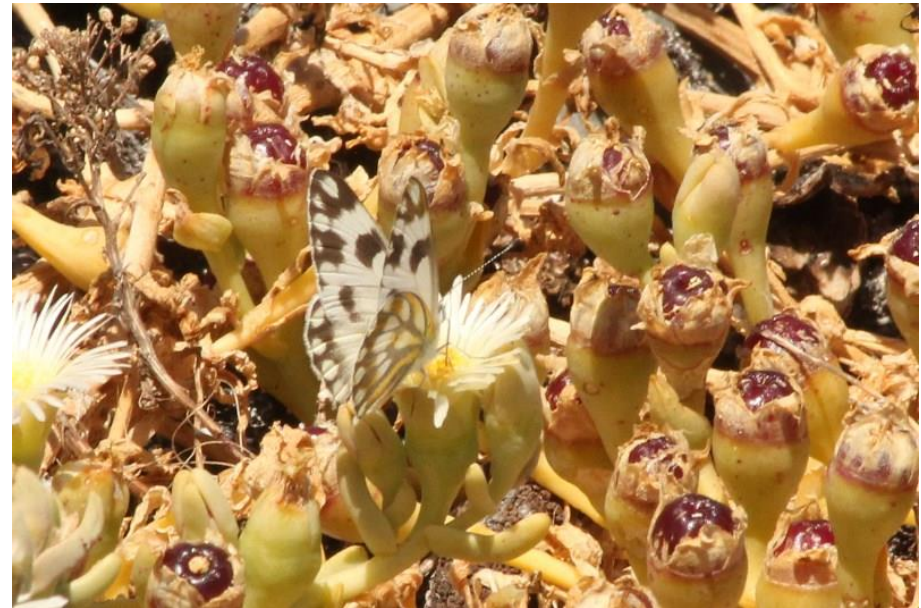
Figure 2. Common Meadow White

The Painted Lady (Family Nymphalidae) (Figure 1) is one of the most widespread butterflies in the world, found on every continent except Antarctica and South America. These butterflies migrate in large numbers from northern Africa into Europe every year (Butterfly Conservation 2012). Painted Ladies prefer dry open habitats, but they can be found throughout South Africa.