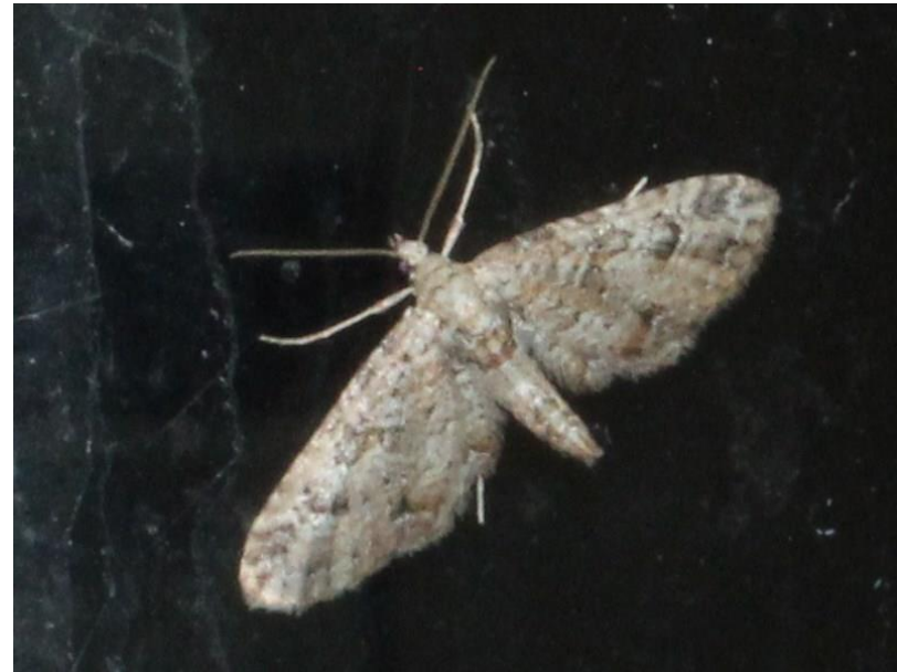
Figure 10. Xanthorhoe transjugata

This is a medium-sized moth (Family Noctuidae) with a wingspan of 34 mm. Stolid Lines (Figure 9) are common throughout Africa, Europe and Asia (Picker et al. 2004). In Europe, the larvae of the this moth feed on oak, puncture vine ( Tribulus sp.) and bramble ( Rubus sp.) (Picker et al. 2004).