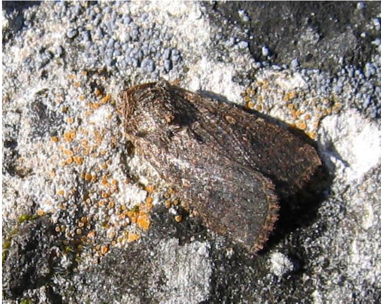
Figure 11. Cape Lawn Moth photographed by Rene Navarro http://vmus.adu.org.za/?vm=LepiMAP-14700