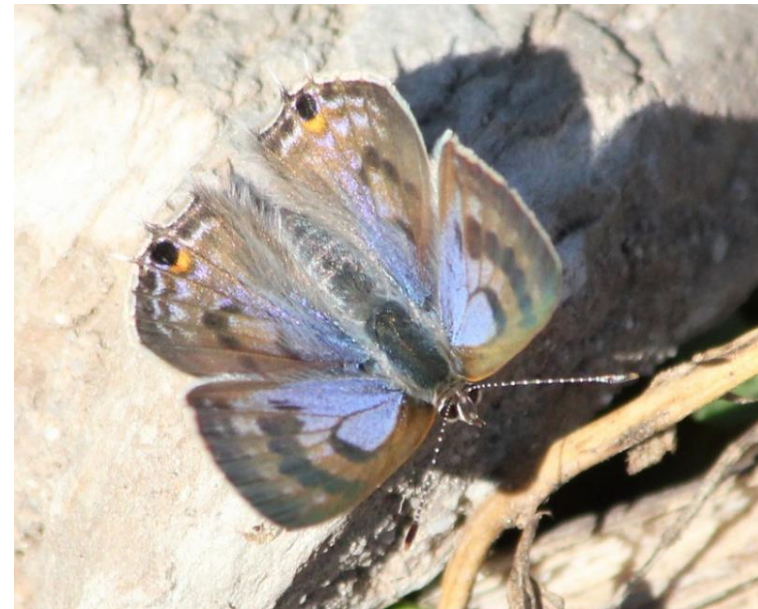
Figure 6. Common Hairtail photographed by Les Underhill http://vmus.adu.org.za/?vm=LepiMAP-593020

it to the LepiMAP section of the ADU Virtual Museum at http://vmus.adu.org.za/ . Your record may show an extension of the range of this species.