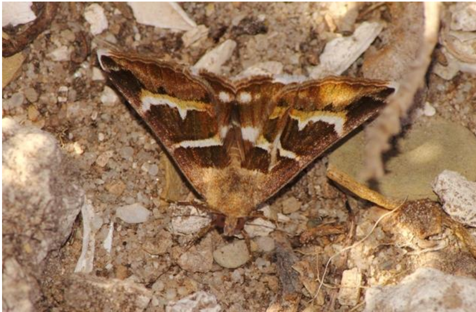
Figure 9. Stolid Lines