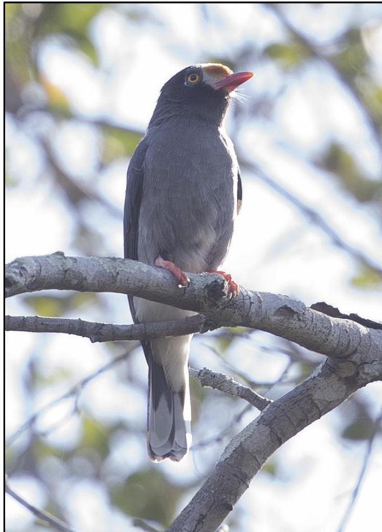
Fig 2 – One of the Chestnut-fronted Helmet-Shrikes observed near Chilo Gorge Lodge