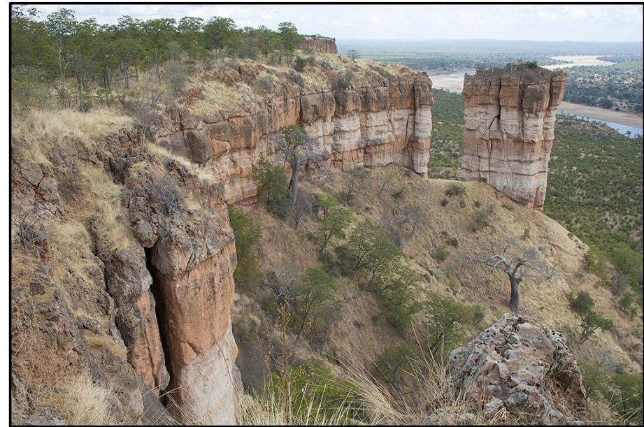
Fig 3 – The renowned Chilojo Cliffs in the Gonarezhou National Park in Zimbabwe