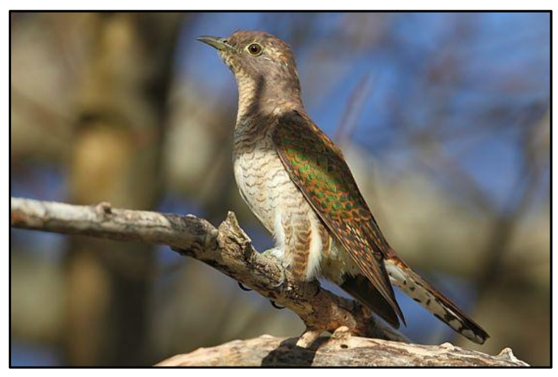
Fig 2 - Female Klaas's Cuckoo