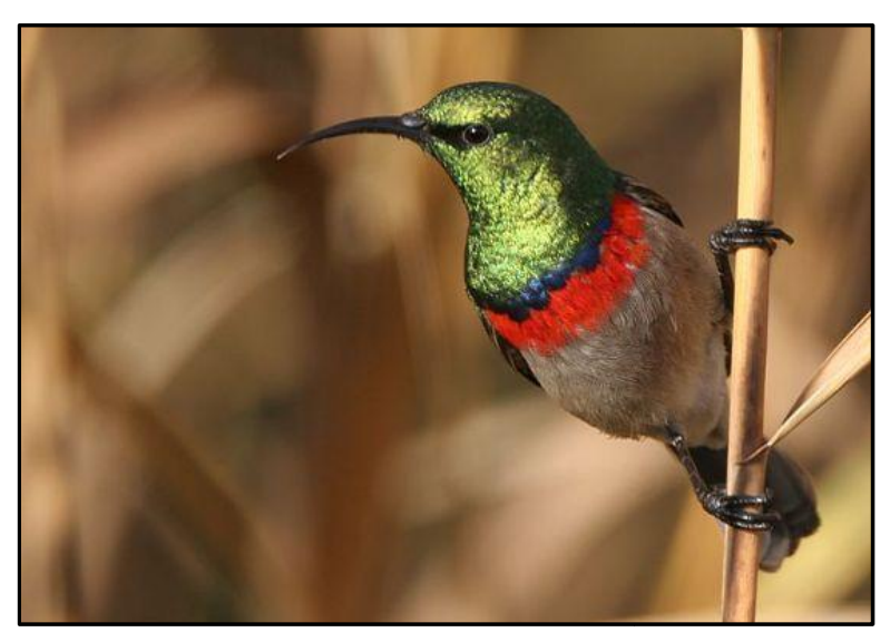
Fig 1 - Male Southern Double-collared Sunbird

Little R 2013. Calling Klaas's Cuckoo. Promerops 296: 15.