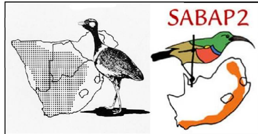
Fig 1 – The logos for SABAP1 and SABAP2. SABAP1 collected 7.3 million records of bird distribution on 140000 checklists. On 9 June 2014, when SABAP2 data were extracted for this analysis, the database contained 5.6 million records on 106 000 checklists..

SABAP1 used quarter degree grid cells (QDGC) as the spatial sampling unit. These cover 15 minutes of latitude by 15 minutes of longitude (15'×15') and correspond to the standard 1:50 000 topographical maps used within southern Africa (Harebottle et al. 2007). The SABAP2 spatial sampling unit is the “pentad” which covers 5 minutes of latitude by 5 minutes of longitude (5'×5'), about 8.0 km×7.6 km. There are nine pentads per QDGC. The pentads are nested within QDGC, and data for each pentad can be combined into QDGC format, which can then be compared with SABAP1 data to detect any large-scale