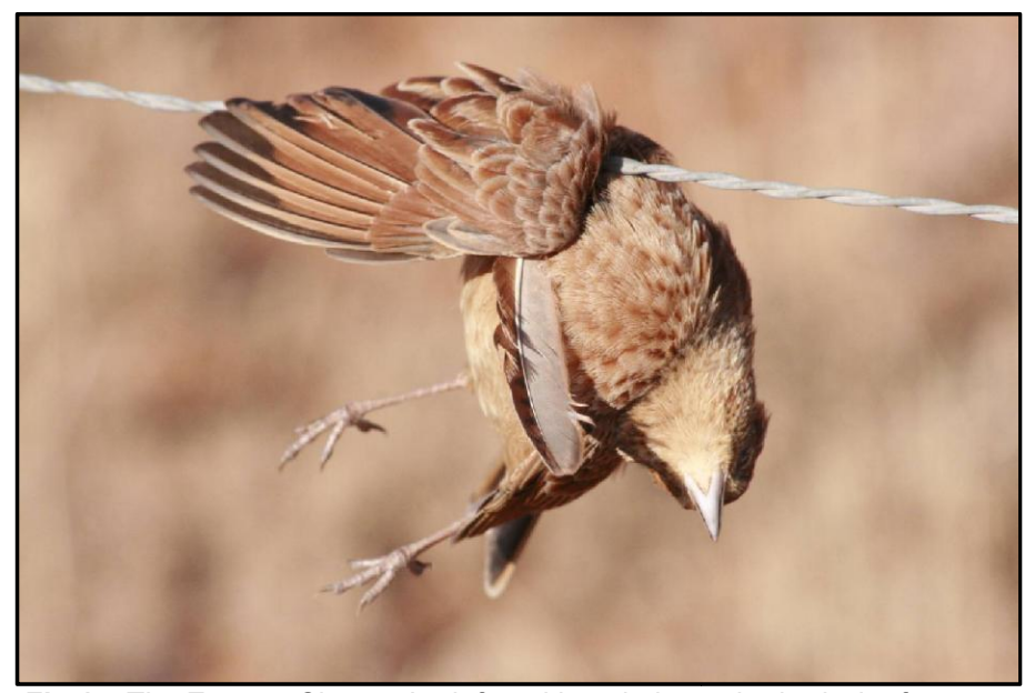
Fig 1 – The Eastern Clapper Lark found impaled on a barbed wire fence at Vaalrand, Boshof on 13 June 2013.

I had to back-track a part of the road that I had already surveyed, and I realised how many birds were missed on the first drive through of that part. While back-tracking I saw an Eastern Clapper Lark hanging on a top wire strain of the barbed wire fence. The specimen was still fresh and watery fluids were running out of its bill. Before collecting the specimen for scientific study purposes, I took some photographs of the bird still on the fence (Fig 1). The skin of the bird was later added to the study skin collection of the Department Ornithology).