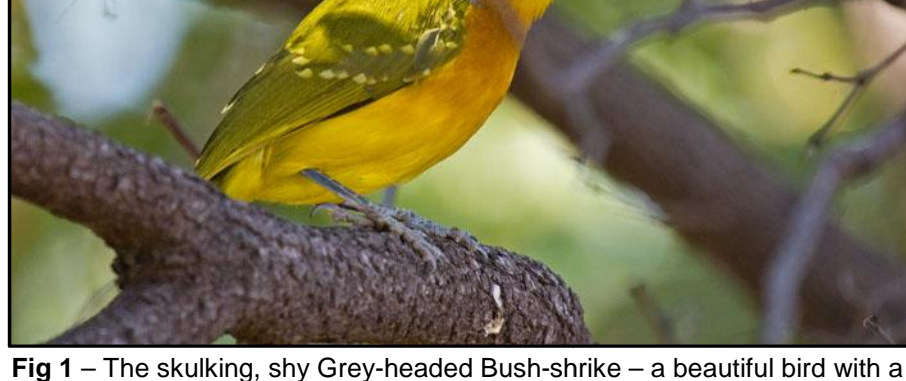
Fig 1 – The skulking, shy Grey-headed Bush-shrike – a beautiful bird with a distinctive call.

In the first Southern African Bird Atlas Project (SABAP1) I recorded this species in the Roodepoort Atlas Square 2627BB very infrequently as it moved through the area as a seasonal migrant. It remained in the area for very brief periods. The SABAP1 distribution map suggests a very low recording rate for the southern part of the Highveld, which represented the southern border of its range in what was known as the Transvaal province. The distribution range is indicated in the map in Figure 2.