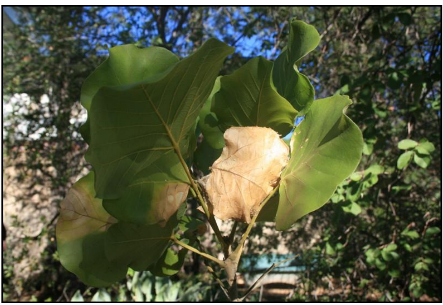
Fig 1 - Barred Wren Warbler nest, using 3 leaves, in a Namib Coral-tree Erythrina decora in central Namibia.

On 1 April 2013 the nest was more closely investigated as it was observed to be deserted. The nest was located at a height of 1.2 m, and construction using 3 leaves, expertly sewn — even tucked together at the corners in places. It was suspended by being "pop riveted" to neighbouring green leaves.