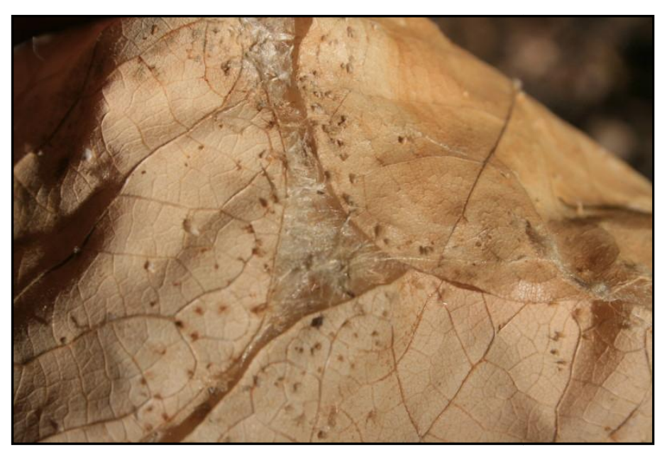
Fig 2 - The elaborate tailoring and "pop riveting" clearly visible.

The entire nest lining consisted of fine white silky plant down, similar to the down associated with the seeds of the near-endemic Elephant vine Strophanthus amboensis found in central Namibia. Seeding of this plant coincides with the general nesting period of the Barred Wren Warbler – i.e. September to April. Hairs associated with the seeds of Milkweed Gomphocarpus fruticosus could possibly be used in the nesting material as well. Both plants are from the Apocynaceae family (Mannheimer and Curtis 2009).