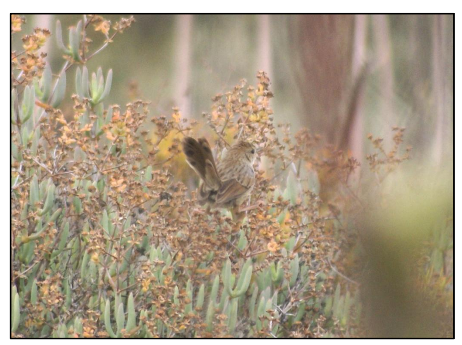
Fig 3 – The Grey-backed Cisticola with back-markings more smudged.

a "pe, pe, peee" call which I have not heard Grey-backed Cisticola make. This sounds complicated. But to summarize, listen for the parts that are different – the trills are distinct and only Wailing Cisticola goes "pe, pe, peee" – forget the rest, it will only confuse you. Do not expect a pipe after every trill; both species can trill for extended periods without piping and in general they trill more than they pipe.