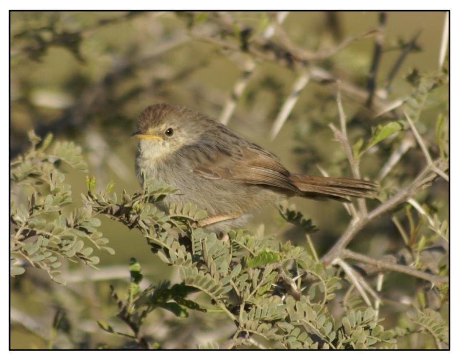
Fig 1 - The Grey-backed Cisticola displaying a grey breast.

They are comparatively easy to tell apart by their physical appearance. It is when it comes to telling them apart by their calls that it gets more complicated. Both species make short clicking and buzzing sounds that intersperse their other calls. It is virtually impossible to tell them apart by listening to these. Both species have a trilled component to their call and both have a piped component. Grey-backed Cisticola's trill is a lower, slower, bubblier trill than that of the Wailing Cisticola. The trill of the Wailing Cisticola is higher pitched, faster and more staccato that that of Grey-backed. One way of explaining the difference is this. If you make a trilling sound by pressing your tongue against your pallet and forcing air through the