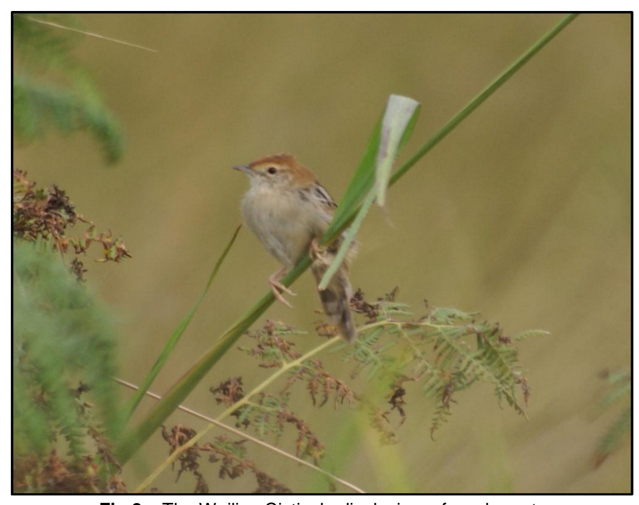
Fig 2 – The Wailing Cisticola displaying a fawn breast.

They are comparatively easy to tell apart by their physical appearance. It is when it comes to telling them apart by their calls that it gets more complicated. Both species make short clicking and buzzing sounds that intersperse their other calls. It is virtually impossible to tell them apart by listening to these. Both species have a trilled component to their call and both have a piped component. Grey-backed Cisticola's trill is a lower, slower, bubblier trill than that of the Wailing Cisticola. The trill of the Wailing Cisticola is higher pitched, faster and more staccato that that of Grey-backed. One way of explaining the difference is this. If you make a trilling sound by pressing your tongue against your pallet and forcing air through the