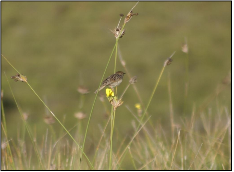
Fig 4 – The Wailing Cisticola showing crisper markings on the back

The photos of Wailing Cisticola were taken on the farm Uitkyk (3355_2215) about 20 km west of George. The photos of Greybacked Cisticola were all taken in the Zebra area 10 km after the turn off to Oudtshoorn along the N12. The sound clips submitted to the RAC were also recorded in these areas.